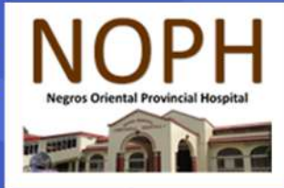
NEGROS ORIENTAL PROVINCIAL HOSPITAL